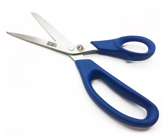
BST 9 Scissors