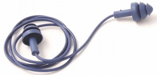
Fully detectable 3 flange re-usable earplugs

These metal detectable earplugs and the connecting chord are manufactured using soft, flexible, silicone rubber containing an evenly dispersed metal detectable additive. Each plug contains metal crimp around the end of the chord for added detectability. This metal component is completely encased within the detectable silicone plug. These detectable earplugs offer good attenuation throughout all frequencies, protecting the ears whilst displaying due diligence in the prevention of foreign body contamination.