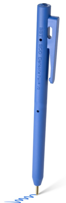
DETECTAPEN ECO V2.0

Thanks to the high-quality ink cartridge, the pen offers a smooth and smudge-free writing experience.